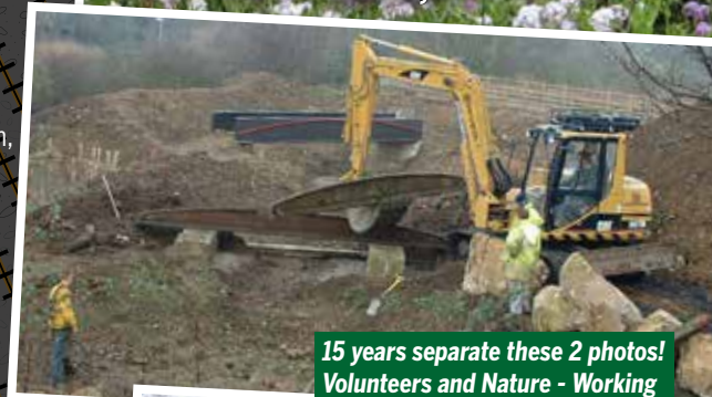
15 years separate these 2 photos! Volunteers and Nature - Working together for Everyone!